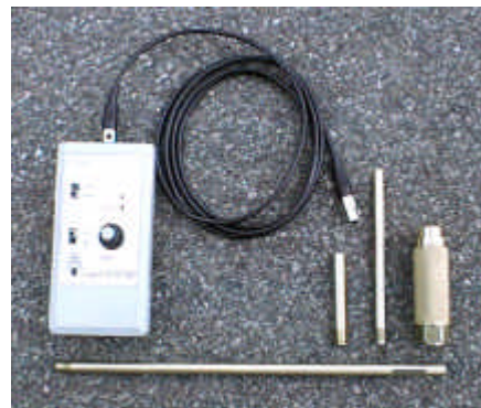
The complete WD 60 Pro CSC system

Probes for other special tasks can also developed.