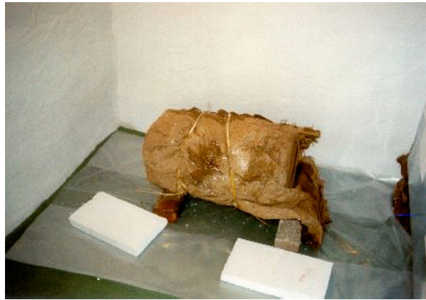
Sample trunk in quarantine room

After storing the sample trunk in quarantine room at once life activity checks were done for proofing the condition of the trunk and larvae.