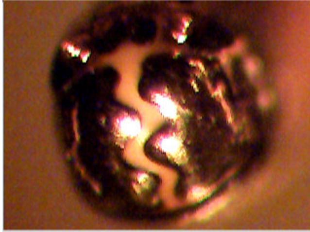
Jaw of an adult Red Palm Weevil

During the anatomic studies the functionality of the tools of the adult weevil was examined. The result is that the functionality of the jaw placed in the end of the snout is completely given. At later stages the use of this tools could be documented during the infestation of the young date palm which was also placed in the quarantine room.